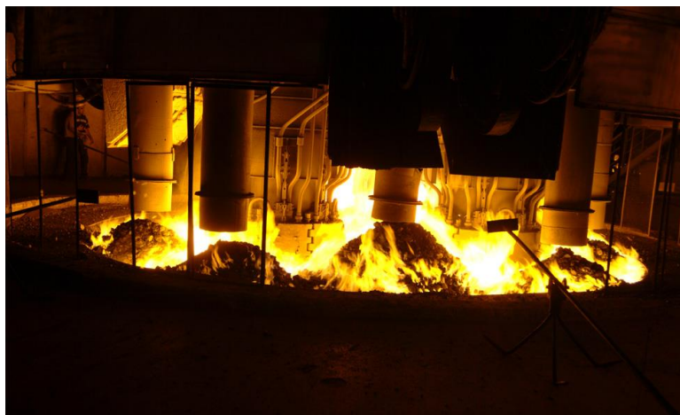
Figure 1: Opened type submerged arc furnace, Eti Krom Inc.

Required heat source for carbothermic reduction reactions is supplied by electrical arc. The arc generates a temperature between 2,500 °C and 3,000 °C at the reaction zone. Simultaneously, a blend containing raw materials and reductants in the furnace charge are smelted by consuming excessive quantity of electrical energy.