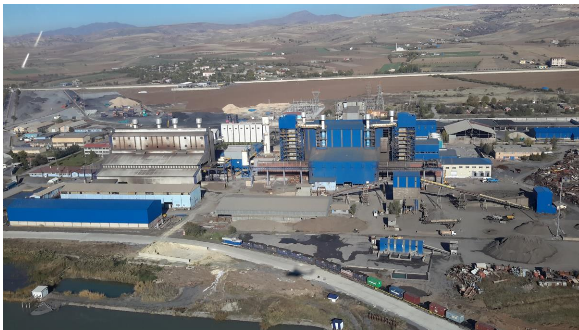
Figure 3: Eti Krom plant site